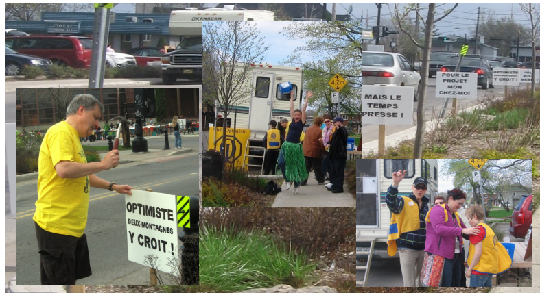
Road Block Photos: May 2011

Contact Sylvie Martell for details: sylvie.martell@sympatico.ca /450-475-8946